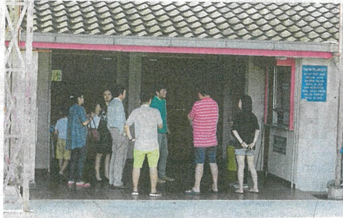
A group of people believed to be family members of victims at the Kajang Hospital mortuary yesterday.