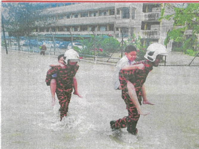
Firefighters evacuating pupils of SJK (C) Tukau in Miri yesterday.