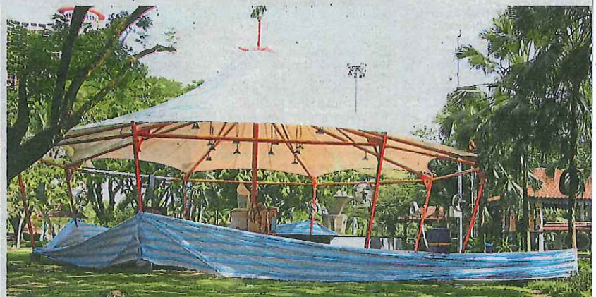
Park-goers want MBPJ to speed up the opening of the outdoor library in Taman Jaya.