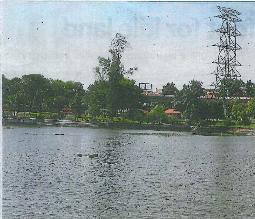
Selva says enzyme should be used to treat the lake just like what is being done in Taman Aman.

"The jogging and walking pavements were repaved not too long ago but some parts are damaged and unsafe for users.