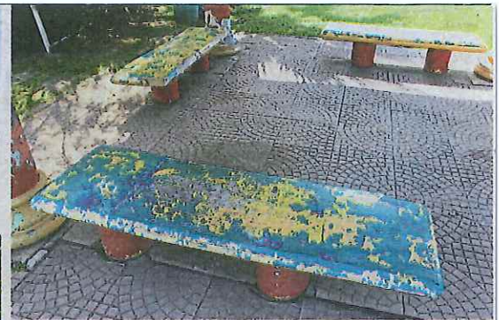
The poor condition of benches at Taman Jaya.