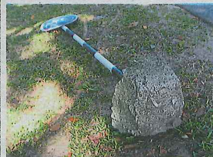
A toppled signage poses a danger to park-goers, especially children.