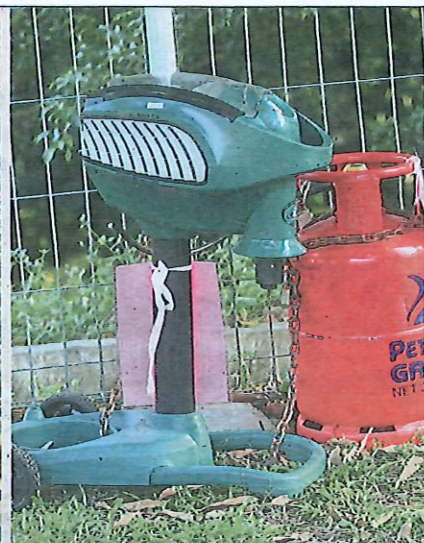
The mosquito magnet machine will be installed between Sekolah Agama Menengah Bestari Subang Jaya's teachers' quarters and the school.