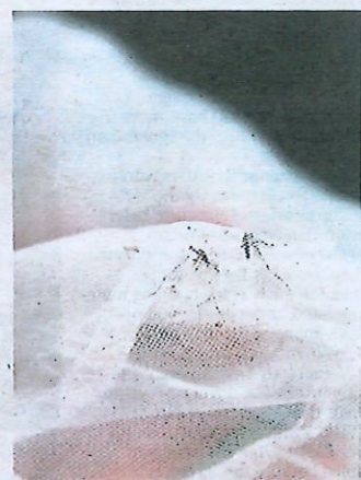
Mosquitoes are attracted to the odour emitted by the mosquito magnet machine.

She added that the situation could become an "uncontrollable epidemic" if mosquito-breeding grounds were not elimi-