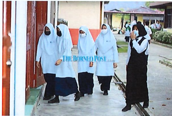
Students arrive in school for their UPSR examination donning face masks.

The haze, which began to worsen over the weekend, has caused schools to close around the city, though those sitting for their Ujian Pencapaian Sekolah Rendah (UPSR) examinations will have to sit for their papers despite the poor air quality.