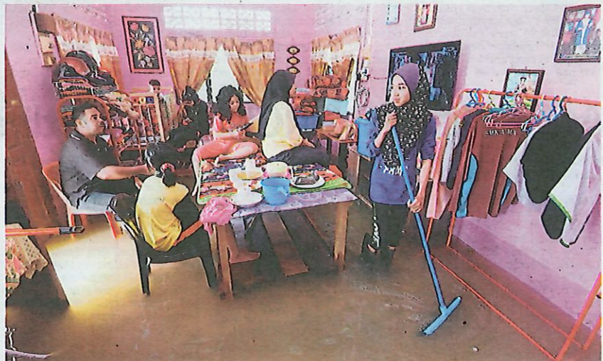
In deep water: A family of seven making the best of their situation in their flooded home at Kampung Tok Subuh, Bukit Mertajam.

Zairil also announced a RM1mil allocation from the state to deepen the 1.5m-deep estuary in Sungai Juru to help water flow out to the sea faster.