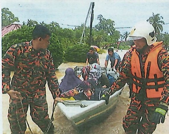
Off to safety: Fire and Rescue Department personnel escorting residents out of their homes at Kampung Pulau, Gelang Patah.