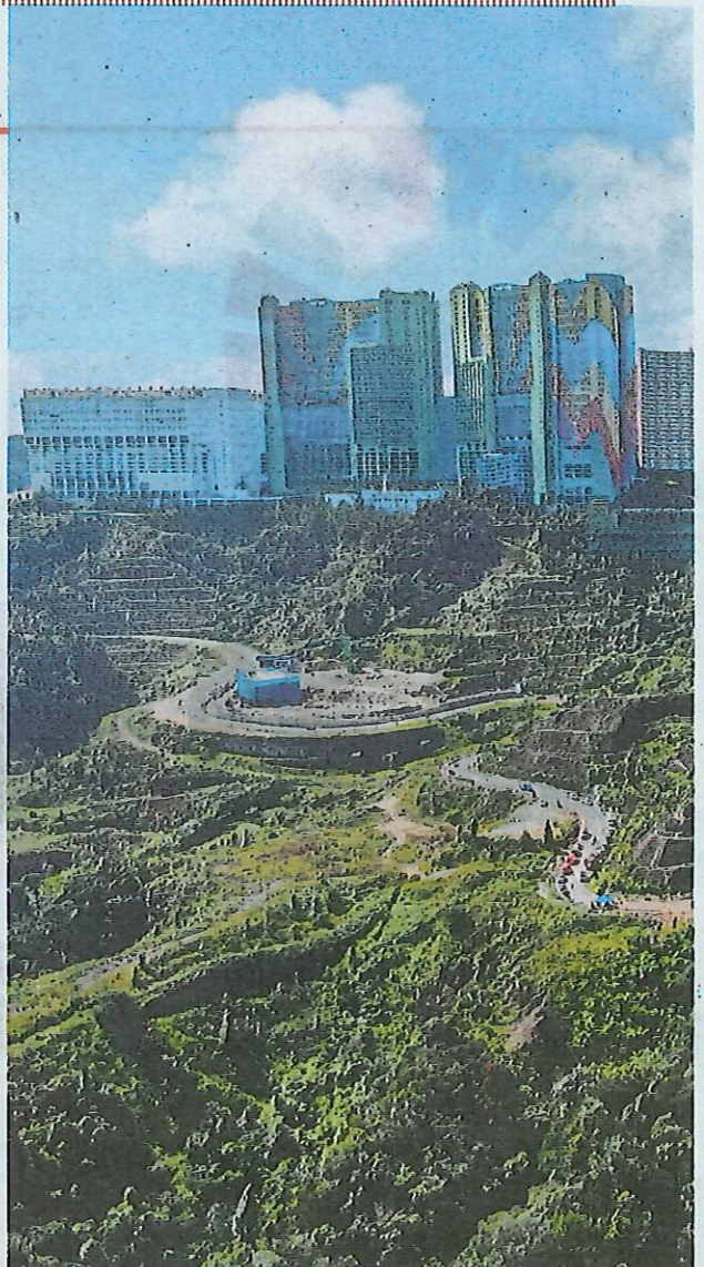
The landslide that hit Jalan Genting-Amber Court towards Amber Court in Genting Highlands.

The landslide has not affected the main route to Genting Highlands as it occurred at a route leading to a different part of the resort.