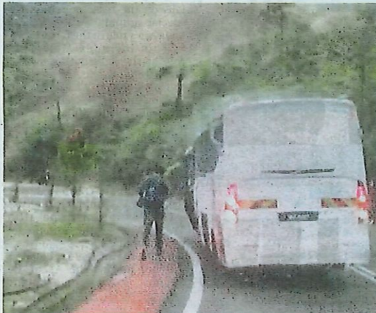
The landslide in Jalan Genting-Amber Court in Genting Highlands was recorded on a mobile phone by a bus passenger on Tuesday.

A video of the incident, believed to be taken by passengers in the second bus, has since been