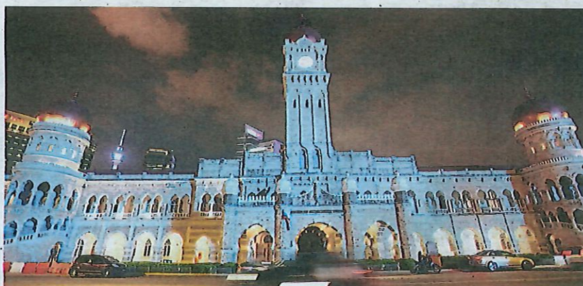
Bangunan Sultan Abdul Samad is one of the buildings to be upgraded under DBKL's budget next year.

On other facilities, four new libraries will be completed in 2020 located in Pudu Ulu, Masjid Al-Rahimah (Kampung Pandan), PPR Sri Semarak and at PPR Kelantan.