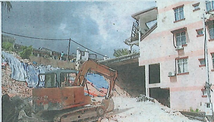
Repair works at Taman Lagenda Mas, Jalan Mas 11, in Cheras due to a landslide.