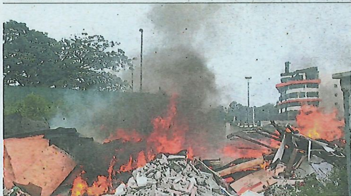
Open burning at the illegal dumpsite next to Silk Highway in Balakong.