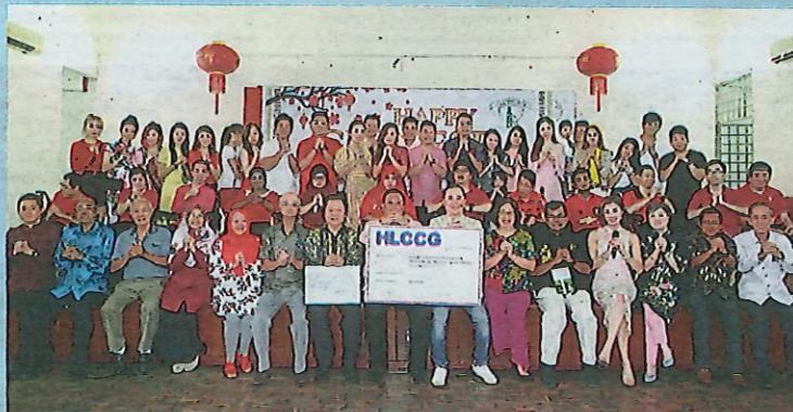
CHARITY EVENT BRINGS JOY Association for disabled children gets RM42,888 from donors at early Chinese New Year do >8

Selayang Municipal Council's Tasik Biru in Kundang which was once a hub for jet ski races, needs to be upgraded so it can add value as a tourist destination in Rawang. >2&3