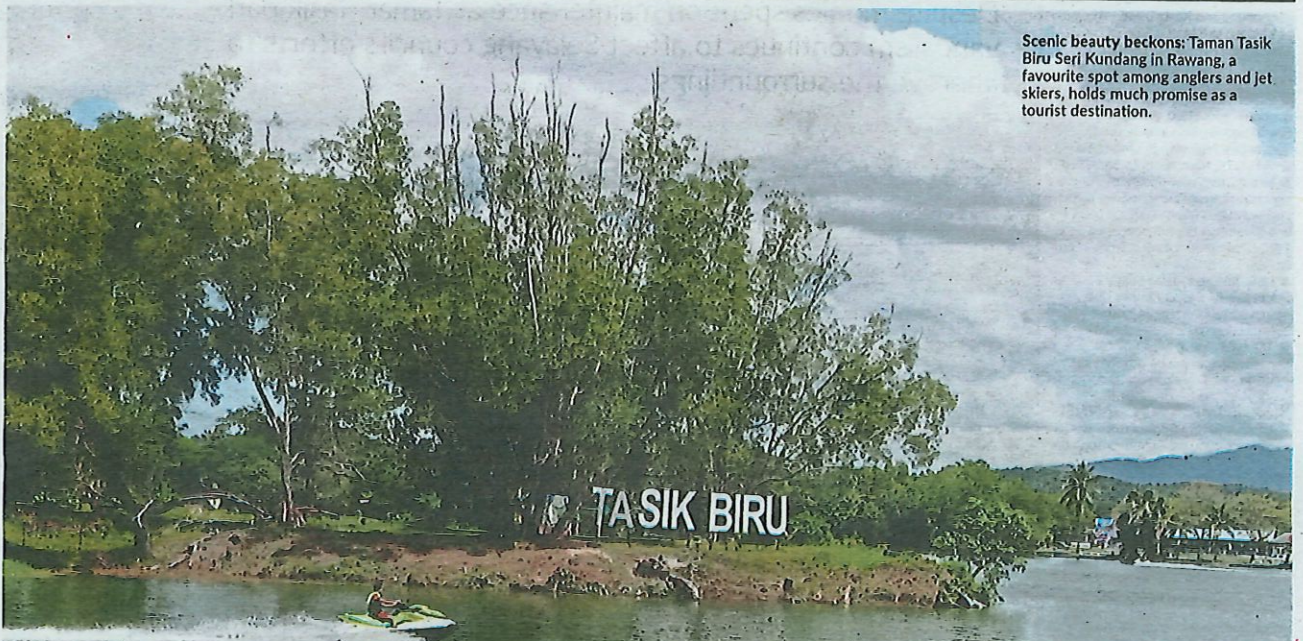
Scenic beauty beckons: Taman Tasik Biru Seri Kundang in Rawang, a favourite spot among anglers and jet skiers, holds much promise as a tourist destination.