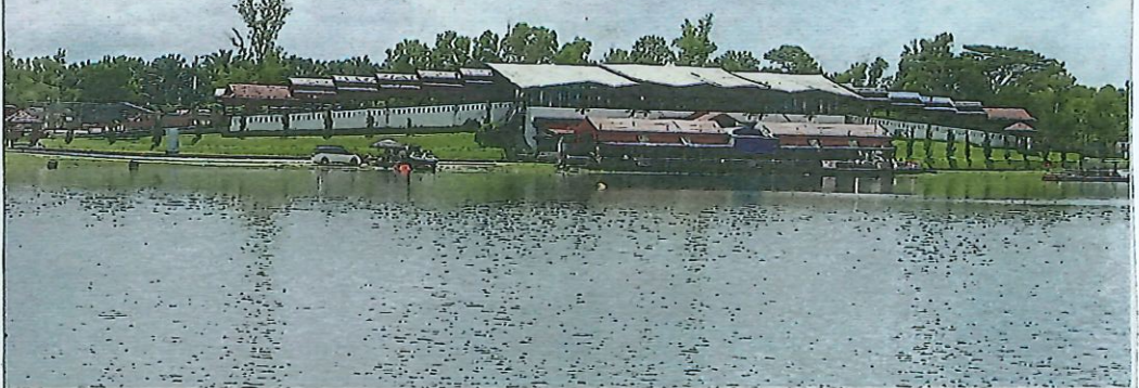
Tourism Ministry gave RM1.8mil to build the pavilion in Tasik Biru in 2012. The space, which has an air-conditioned hall for 500 people, is now rented by a restaurant.

Despite monies spent on maintenance at Taman Tasik park, vandalism continues to affect Selayang council's efforts to improve the surroundings