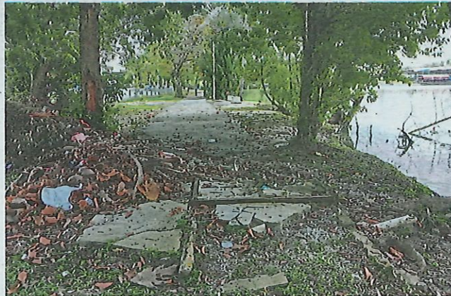
Under MPS' master plan from 2018 to 2028, the 2.2km jogging path starting from Laguna Biru to Jalan Setia Apartment in Tasik Biru will be spruced up.

International Jetsports Challenge, was in 2016.