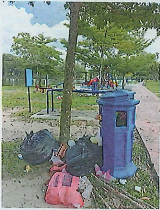
Dustbins at the lake park were overflowing with rubbish, drawing flies and vermin.