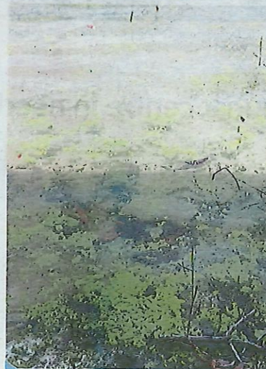
A proposal for a water quality pollution prevention programme was submitted to MPS in 2018 to address the algae problem in Tasik Biru.

On the parking issue, Syamsul said once the land beside the futsal court was gazetted, the department would look into building a parking area for visitors. At present, there is a 500sq m parking area nearby the entrance to the park on Jalan Tasik Biru 1.