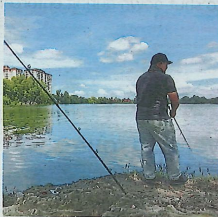
Firdaus says Tasik Biru still draws avid anglers.