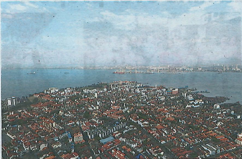
View to making a difference: George Town is taking steps in meeting the challenges of climate change.

tions from Khartoum (Sudan), Salvador (Brazil), Dublin (Ireland) and Miami (United States) as they vied for the honour of demonstrating climate leadership.