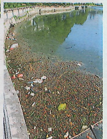
The park's lake banks are in dire need of a clean-up. — Filepic