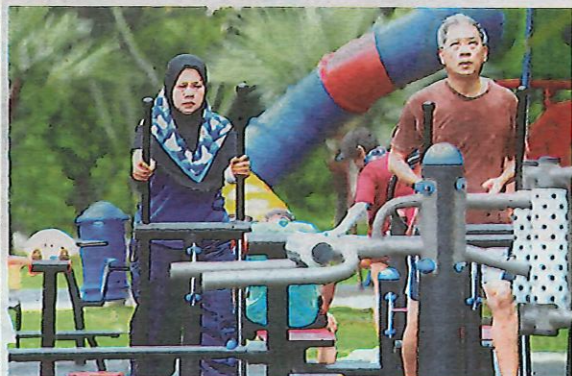
Taman Jaya's outdoor gym equipment is popular with park-goers.