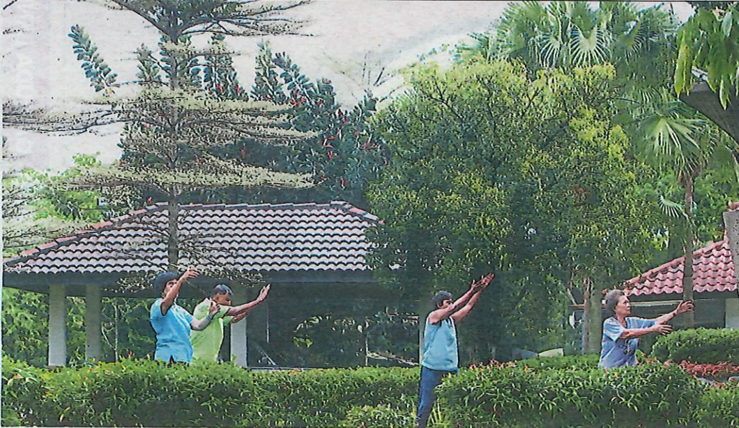
Senior citizens performing light exercises is a daily scene at Taman Jaya.